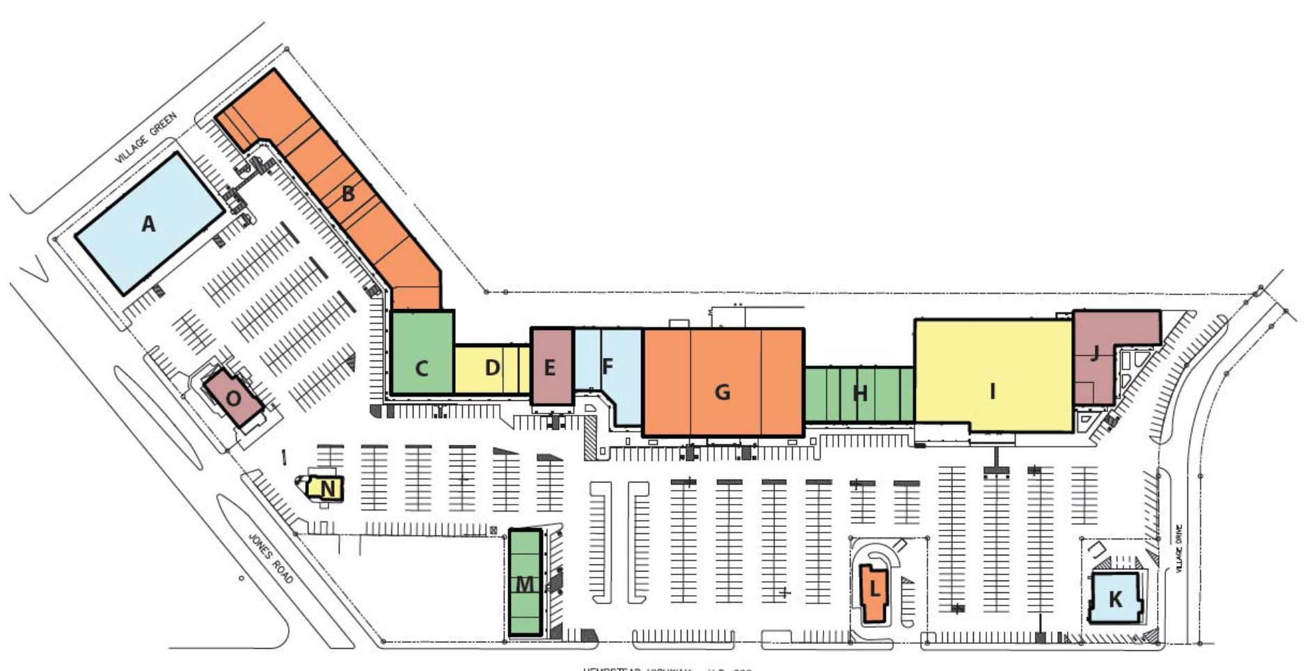
HEMPSTEAD HIGHWAY U.S. 290